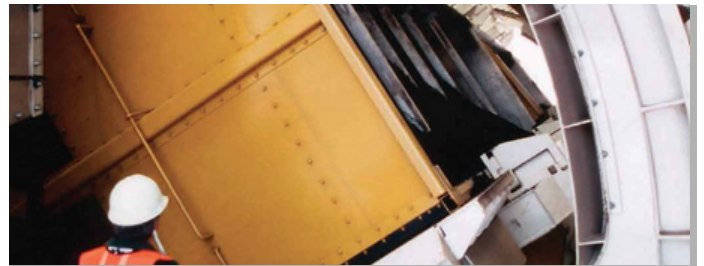
Material handling: Railcar Dumper and Positioner Systems