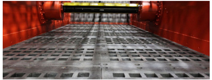
Screening: Ellipti-Flo Series™