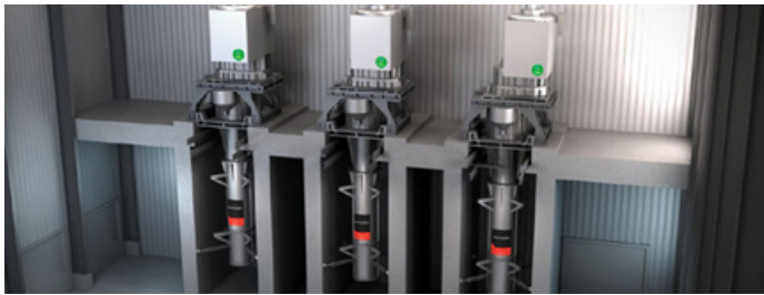
Mills: HIGmill™ Range